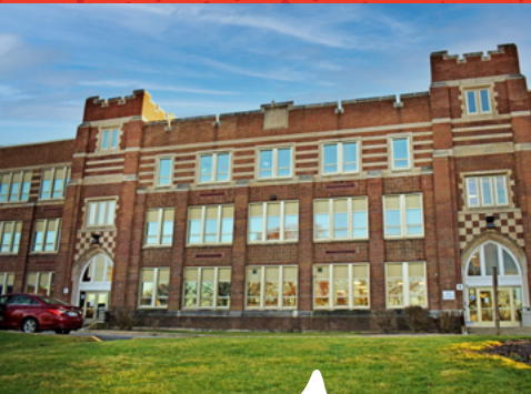
WOODSTOCK High School

If your career interests take you closer to Chicago, Metra stops right in Woodstock and will have you downtown in just over an hour. Milwaukee, Madison, Lake Geneva, and Rockford are all within an easy drive too. Woodstock is even a destination for small planes with nearby Galt Airport just a 10-minute drive away. We're far enough away from the big cities to avoid the frantic pace and noise of urban life, but distinct enough to be more than just another suburb. Here, you can bask in the natural beauty of McHenry County, from the Chain O'Lakes and Fox River to Rush Creek Conservation Area , yet have the comforts and amenities of city living.