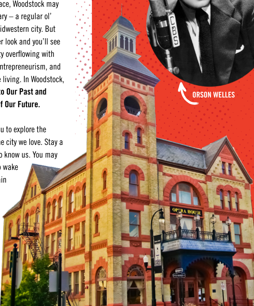
WOODSTOCK Opera House