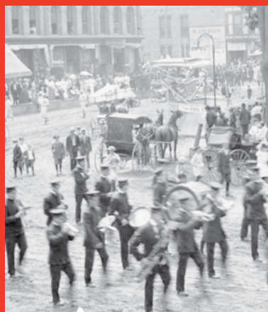
Oliver Typewriter Band JULY 4, 1910

But there's more to our heritage. Did you know in our early years we were also known as "The Typewriter City," birthplace of more than half of the world's typewriters? Both the Emerson Typewriter Company and Oliver Typewriter Company set up shop right here.