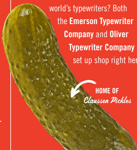
HOME OF Claussen Pickles

No wonder Orson Welles and Chester Gould called Woodstock home! Welles spent time here pursuing theater and radio, launching one of the most legendary film careers of all time. Gould penned his famous " Dick Tracy " comic strip here. Legends like Paul Newman , Tom Bosley , Shelley Berman , Geraldine Page , Lois Nettleton , and Betsy Palmer also found their beginnings at the Woodstock Opera House .