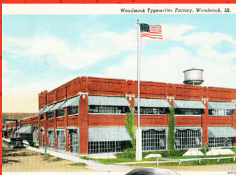
WOODSTOCK TYPEWRITER FACTORY

We invite you to explore the history of the city we love. Stay a while. Get to know us. You may just want to wake up here again and again.